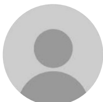
Marcello Ferraro Italy