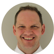
Ian Vlok, South Africa