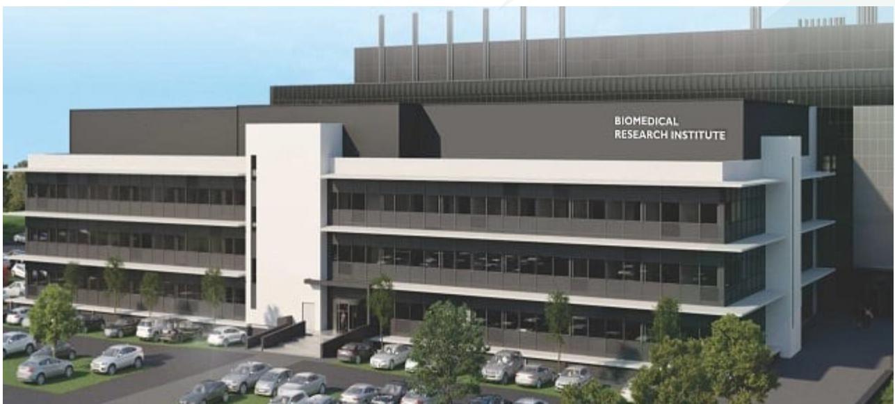
Biomedical Research Institute (BMRI) at Tygerberg Hospital