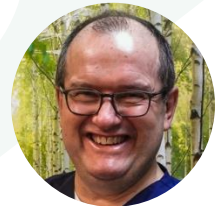
Francois Theron Muelmed Rehabilitation Center