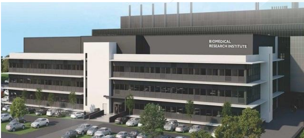
Biomedical Research Institute (BMRI) at Tygerberg Hospital